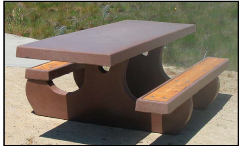
Concrete Picnic Table - $5,300

The Department does not warrant or guarantee the life of donated trees.