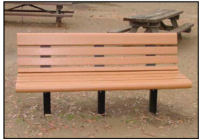
Bench with back - $3,050