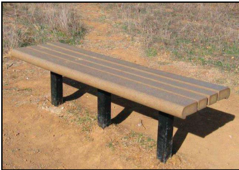
Bench without back - $2,750